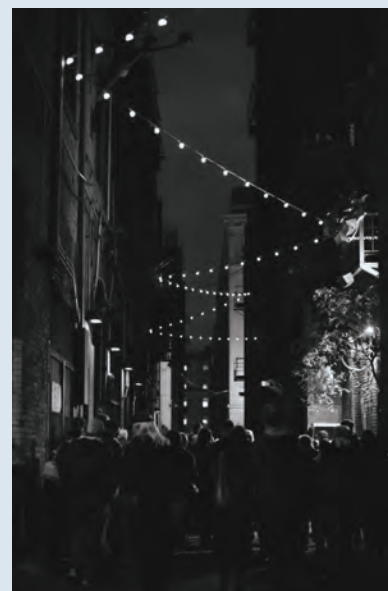
Pioneer Square, Nord Alley activation