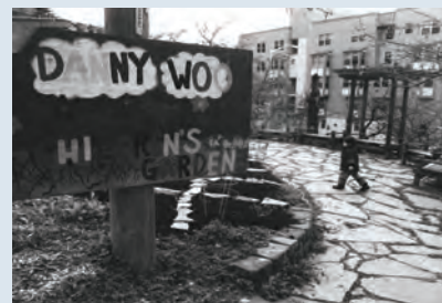
Danny Woo Children's Garden