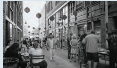
Chinatown-ID, Canton Alley activation